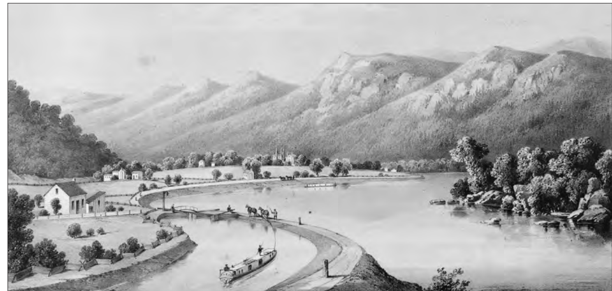
The James River Canal at Glasgow, near the mouth of the North (Maury River), 1857. From Edward Beyer, Album of Virginia, Library of Congress.

Work then moved upstream toward Thompson's Landing. ❹ Here were a post office, a store, almost certainly a warehouse, and likely a ferry to provide a river