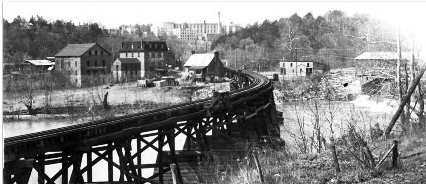
Jordan's Point across the Maury River, after the railroad replaced the North River Canal. In the distance is the Virginia Military Institute.

or ferry tolls to make and receive shipments. In November 1860, the first canal boat arrived at Jordan's Point.