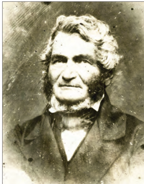
Claudius Crozet, daguerreotype, c. 1855.

For all the lessons here in economic history, we still have to admire the stout fellows who pressed so hard to improve our lot.