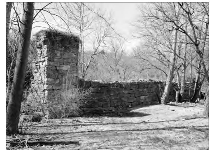
Remnants of North River Canal dam and lock at South River.

One merchant set up his business on the north side with his own dock. He advertised that customers in the northern part of the county would not have to pay bridge